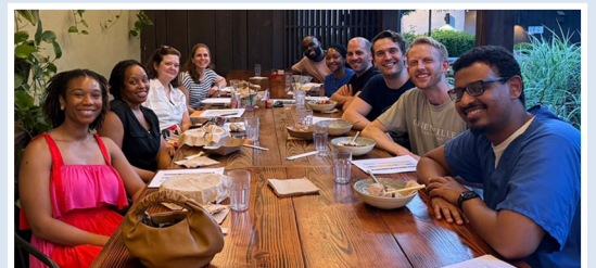
Global Health Clinical Elective Rotation Trainees at Curriculum Night

This year, we will send residents from Internal Medicine (5), Pediatrics (4), Med/Peds (3), OB/GYN (2), Med/Psych (1), and Neurology (1) for Global Health Clinical Elective Rotations. They will be traveling to partner institutions in Moshi and Mwanza, Tanzania; Eldoret, Kenya; Bangkok, Thailand; Shiprock, New Mexico (Indian Health Service); and Iquitos, Peru.